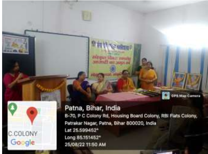
Patna, Bihar, India B-70, P C Colony Rd, Housing Board Colony, RBI Flats Colony, Patrakar Nagar, Patna, Bihar 800020, India Lat 25.599452° Long 85.161452° 25/08/22 11:50 AM