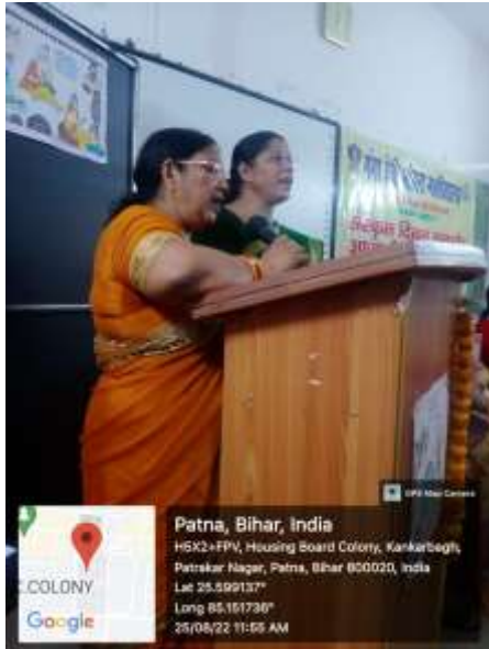
Patna, Bihar, India H5X2+FPV, Housing Board Colony, Kankarbagh, Patrakar Nagar, Patna, Bihar 800020, India Lat 25.599137° Long 85.161736° 25/08/22 11:55 AM