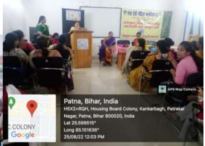
Patna, Bihar, India H5X2+RQH, Housing Board Colony, Kankarbagh, Patrakar Nagar, Patna, Bihar 800020, India Lat 25.599515° Long 85.151836° 25/08/22 12:03 PM