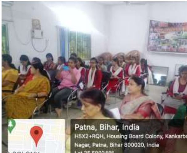
Patna, Bihar, India H5X2+RQH, Housing Board Colony, Kankarbagh, Patrakar Nagar, Patna, Bihar 800020, India Lat 25.599249° Long 85.15173° 25/08/22 11:51 AM