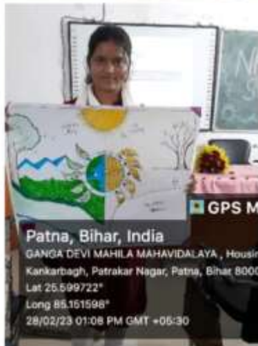
Patna, Bihar, India GANGA DEVI MAHILA MAHAVIDALAYA , Housin Kankarbagh, Patrakar Nagar, Patna, Bihar 8000 Lat 25.599722° Long 85.151598° 28/02/23 01:08 PM GMT +05:30