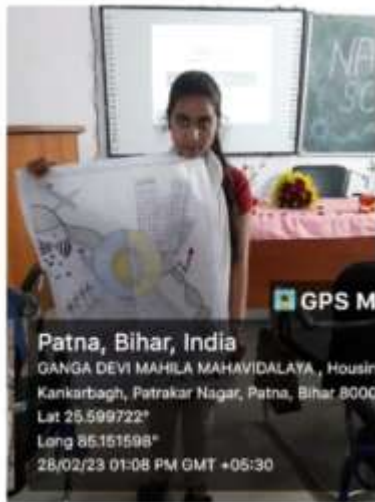
Patna, Bihar, India GANGA DEVI MAHILA MAHAVIDALAYA , Housin Kankarbagh, Patrakar Nagar, Patna, Bihar 8000 Lat 25.599722° Long 85.151598° 28/02/23 01:08 PM GMT +05:30