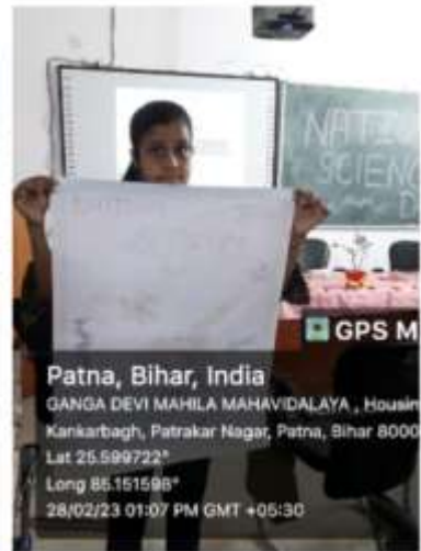
Patna, Bihar, India GANGA DEVI MAHILA MAHAVIDALAYA , Housin Kankarbagh, Patrakar Nagar, Patna, Bihar 8000 Lat 25.599722° Long 85.151598° 28/02/23 01:07 PM GMT +05:30