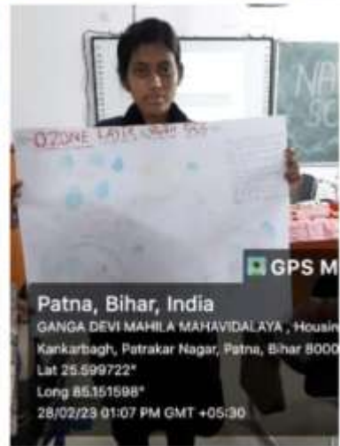
Patna, Bihar, India GANGA DEVI MAHILA MAHAVIDALAYA , Housin Kankarbagh, Patrakar Nagar, Patna, Bihar 8000 Lat 25.599722° Long 85.151598° 28/02/23 01:07 PM GMT +05:30