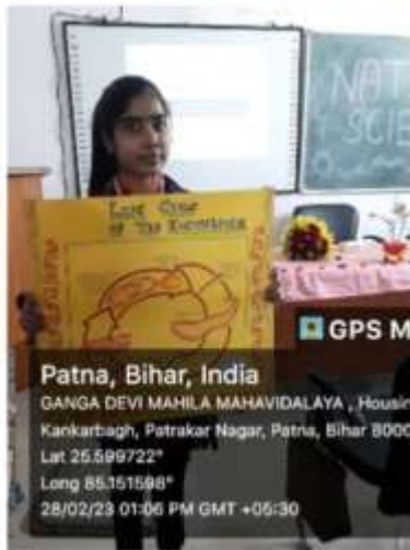
Patna, Bihar, India GANGA DEVI MAHILA MAHAVIDALAYA , Housin Kankarbagh, Patrakar Nagar, Patna, Bihar 8000 Lat 25.599722° Long 85.151598° 28/02/23 01:06 PM GMT +05:30