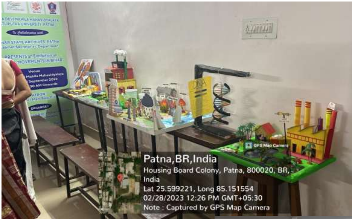
Patna, BR, India Housing Board Colony, Patna, 800020, BR, India Lat 25.599221, Long 85.151554 02/28/2023 12:26 PM GMT+05:30