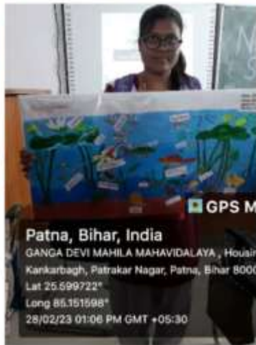
Patna, Bihar, India GANGA DEVI MAHILA MAHAVIDALAYA , Housin Kankarbagh, Patrakar Nagar, Patna, Bihar 8000 Lat 25.599722° Long 85.151598° 28/02/23 01:06 PM GMT +05:30