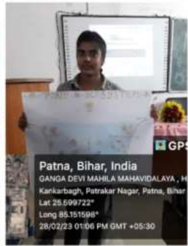
Patna, Bihar, India GANGA DEVI MAHILA MAHAVIDALAYA , H Kankarbagh, Patrakar Nagar, Patna, Bihar Lat 25.599722° Long 85.151598° 28/02/23 01:06 PM GMT +05:30