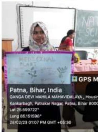
Patna, Bihar, India GANGA DEVI MAHILA MAHAVIDALAYA , Housin Kankarbagh, Patrakar Nagar, Patna, Bihar 8000 Lat 25.599722° Long 85.151598° 28/02/23 01:07 PM GMT +05:30