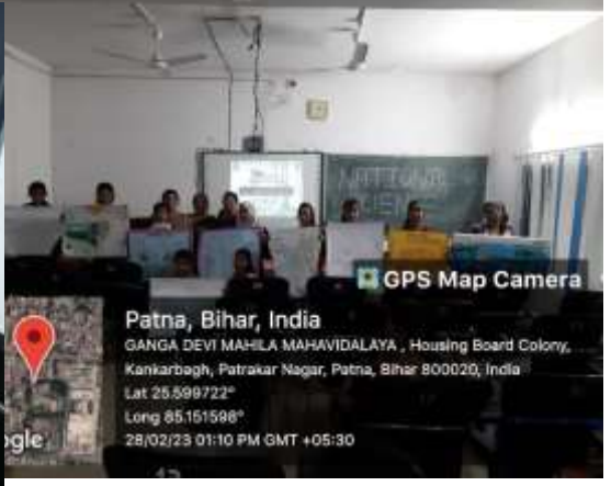
Patna, Bihar, India GANGA DEVI MAHILA MAHAVIDALAYA , Housing Board Colony, Kankarbagh, Patrakar Nagar, Patna, Bihar 800020, India Lat 25.599722° Long 85.151598° 28/02/23 01:10 PM GMT +05:30