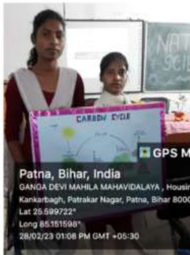
Patna, Bihar, India GANGA DEVI MAHILA MAHAVIDALAYA , Housin Kankarbagh, Patrakar Nagar, Patna, Bihar 8000 Lat 25.599722° Long 85.151598° 28/02/23 01:08 PM GMT +05:30