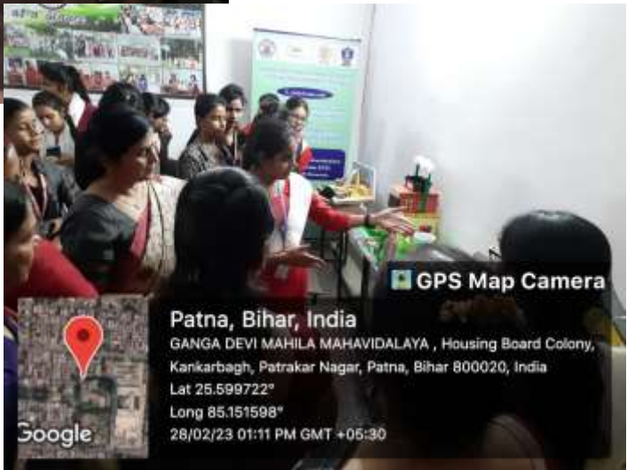
Patna, Bihar, India GANGA DEVI MAHILA MAHAVIDALAYA , Housing Board Colony, Kankarbagh, Patrakar Nagar, Patna, Bihar 800020, India Lat 25.599722° Long 85.151598° 28/02/23 01:11 PM GMT +05:30