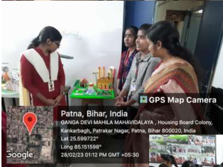
Patna, Bihar, India GANGA DEVI MAHILA MAHAVIDALAYA , Housing Board Colony, Kankarbagh, Patrakar Nagar, Patna, Bihar 800020, India Lat 25.599722° Long 85.151598° 28/02/23 01:12 PM GMT +05:30