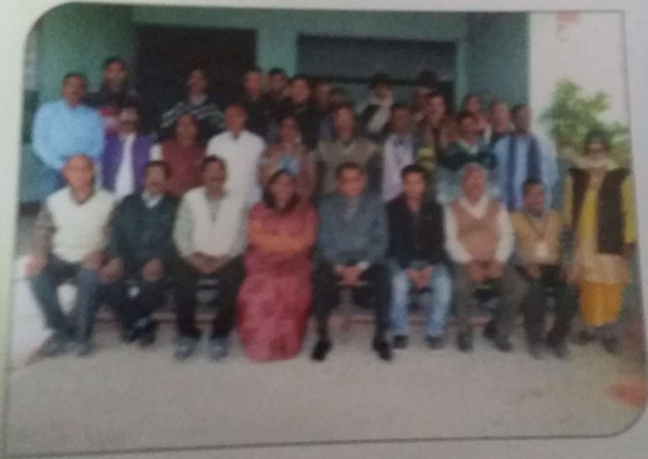
शिक्षक संघ कर्मचारीगण